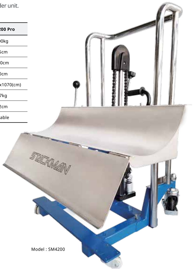
Model : SM4200